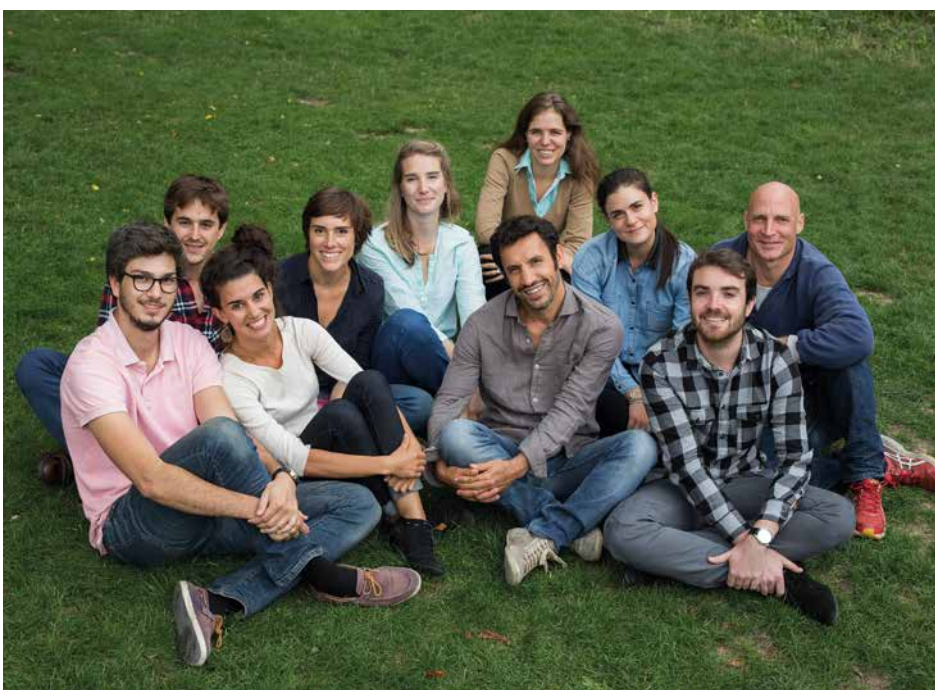
The POLLINIS team in September 2015

melaniee@pollinis.org +33 6 61 04 18 39 POLLINIS 143, avenue Parmentier 75010 Paris